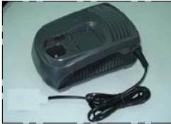
POWER PACK (18V)